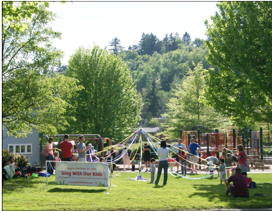
This Maypole has about 35 streamers, and about that many kids! Fun in the sun!